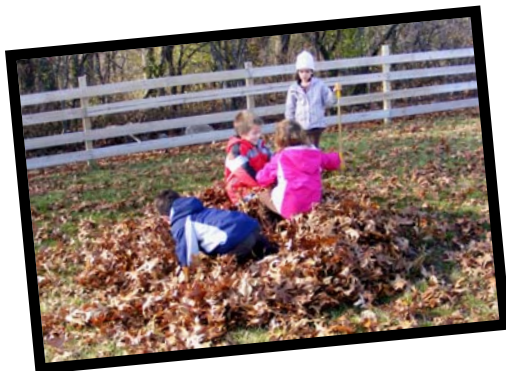
The K-Wrap students make a leaf pile and of course... jump in it!